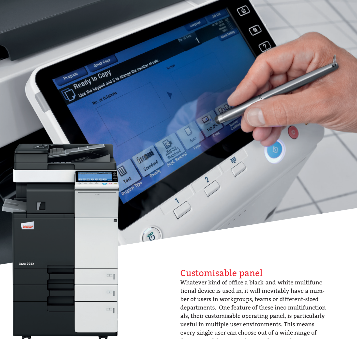
ineo 224e with document feeder (DF-624), inner finisher (FS-533) and large paper feeder (PC-410)