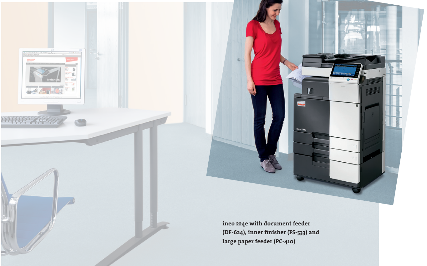
ineo 224e with document feeder (DF-624), inner finisher (FS-533) and large paper feeder (PC-410)

These black-and-white systems come with a number of energy-saving features that cut power consumption by over 40% compared to predecessor models. While this kind of economy saves money, other green features are ecologically beneficial. And that means DEVELOP's ineo e line-up is not only good for the environment but also boosts the owner's green credentials.