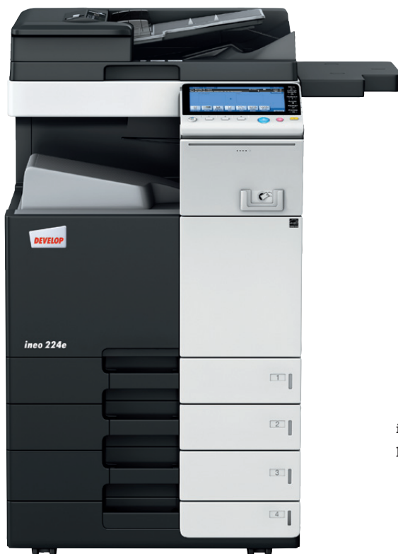
ineo 224e with dual scan document feeder (DF-701), paper feeder (PC-210) and working table (WT-506)

Each of these multifunctional office devices – the ineo 224e, ineo 284e, the ineo 364e, the ineo 454e and the ineo 554e – is not only remarkably easy to use but also offers a wide variety of features to facilitate everyday office tasks. By saving office users time in printing, copying or scanning, they can return to their normal work faster. And that will ultimately help boost productivity.