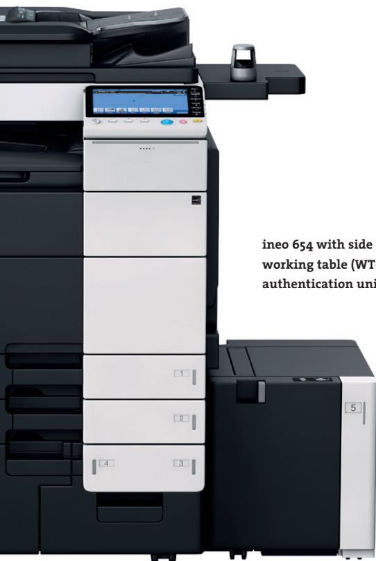
ineo 654 with side paper deck (LU-301), working table (WT-506) and finger vein authentication unit (AU-102)

The ineo 654 prints and copies at 65 A4 pages per minute (ppm). That means your staff can leave this machine to get on with any high-volume job while they carry on with their daily office work. In the multi-user environment of a departmental device or centralised office location and at an in-house printshop, this will also eliminate job queues, or at least shorten waiting times. Since this machine prints or copies in duplex mode at full speed, it will also save you money by reducing your paper consumption on high-volume jobs.