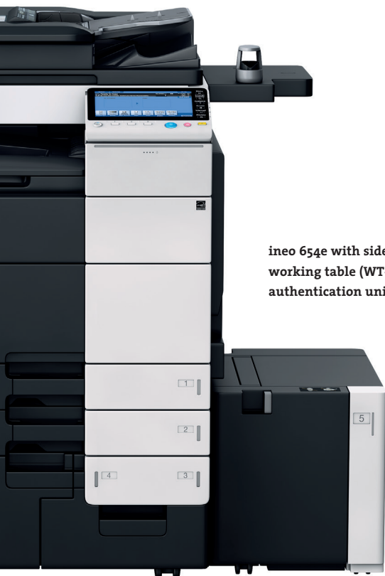
ineo 654e with side paper deck (LU-301), working table (WT-506) and finger vein authentication unit (AU-102)

The ineo 654e prints and copies at 65 A4 pages per minute (ppm). That means your staff can leave this machine to get on with any high-volume job while they carry on with their daily office work. In the multi-user environment of a departmental device or centralised office location and at an in-house printshop, this will also eliminate job queues, or at least shorten waiting times. Since this machine prints or copies in duplex mode at full speed, it will also save you money by reducing your paper consumption on high-volume jobs.