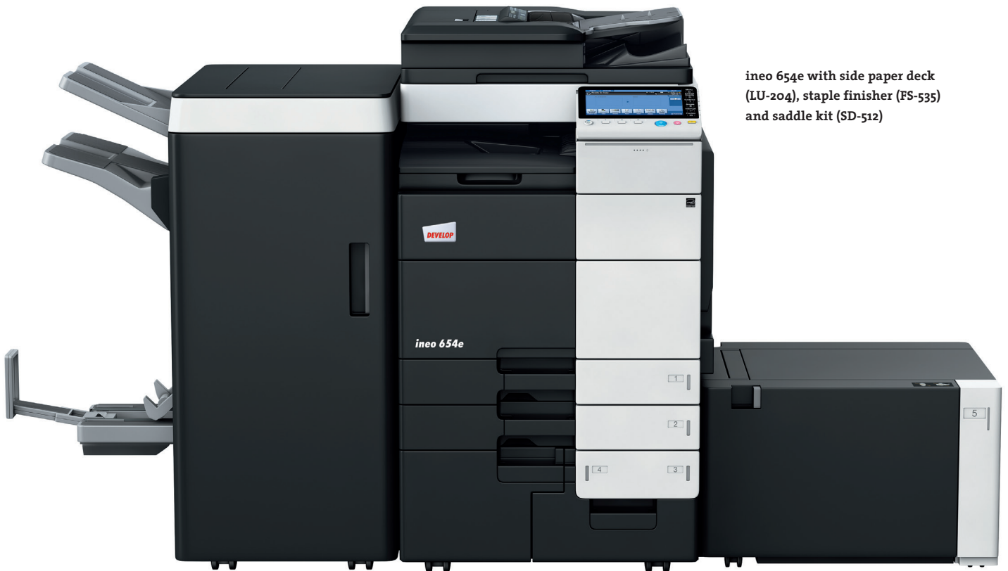
ineo 654e with side paper deck (LU-204), staple finisher (FS-535) and saddle kit (SD-512)

Viruses, Trojan horses, hacker attacks: these days, no business can afford to ignore the challenging issue of IT security. That's why the ineo 654e is certified to ISO 15408 EAL 3, the industry's security standard for multifunctional systems. What's more, it also comes equipped with numerous data-security features such as IPsec encryption, which ensures secure communication channels for all documents passing through your company's network. There is no danger of confidential documents or data getting into the wrong hands either since access to the system can be restricted to authorised users by means of the standard hard-disk encryption kit and authentication technology. This way, we ensure your sensitive data stay secure – now and in future.