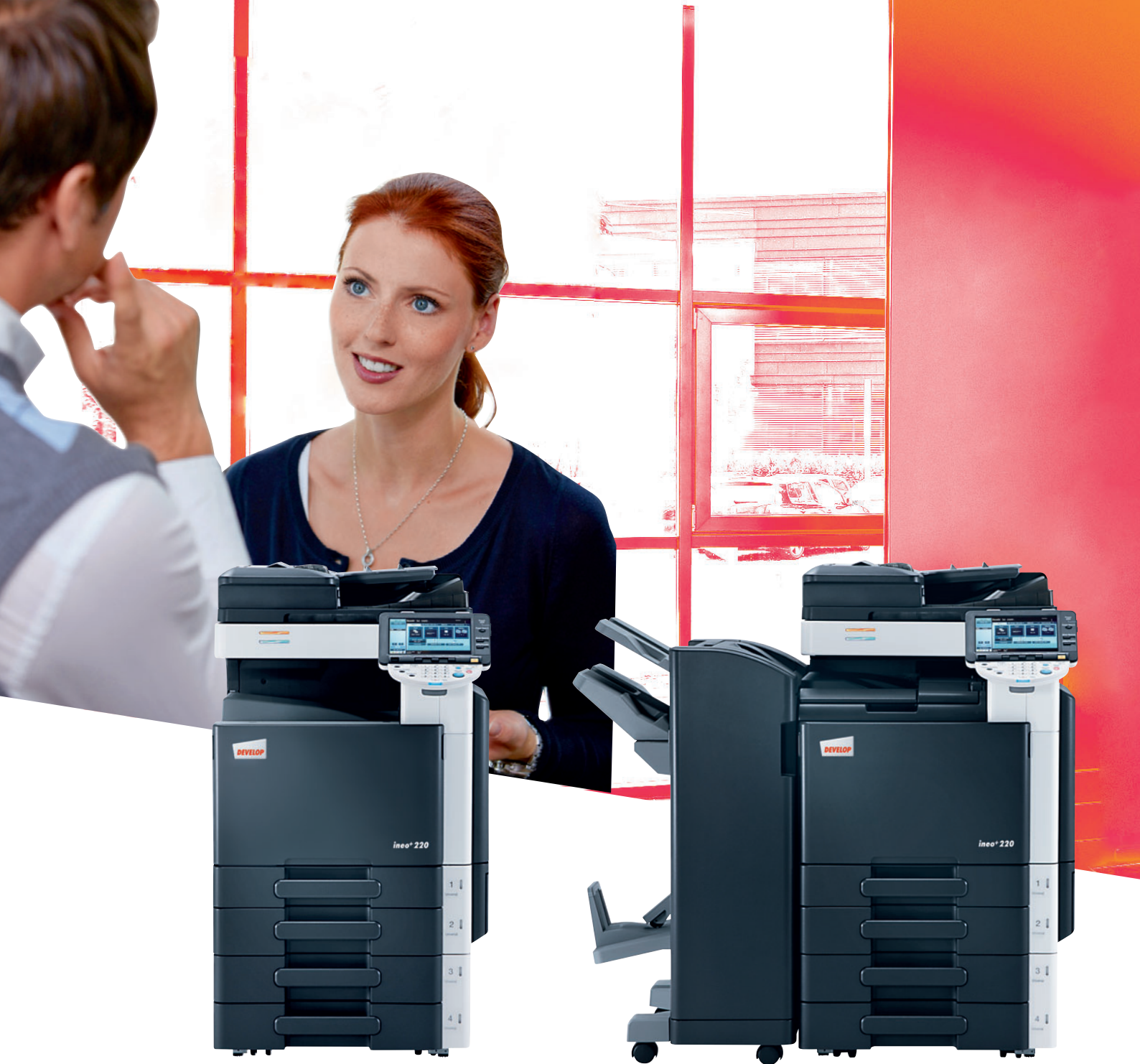
ineo+ 220 with document feeder (DF-617) and 2x 500 sheets universal tray (PC-207)