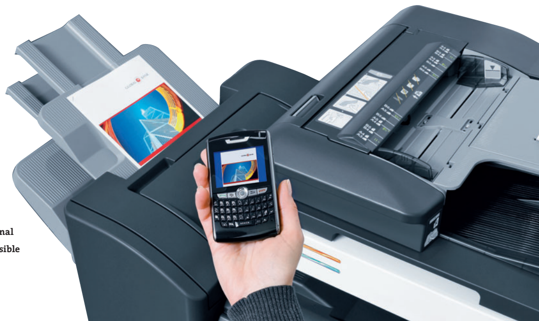
Mobile printing via optional bluetooth connection possible