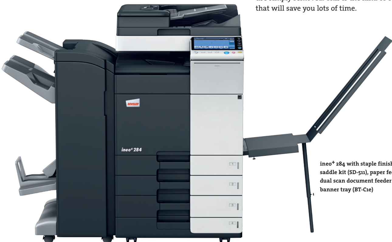
ineo+ 284 with staple finisher (FS-534), saddle kit (SD-511), paper feeder (PC-210), dual scan document feeder (DF-701), banner tray (BT-C1e)

Many multifunctional office systems are anything but user-friendly. The ineo+ 284, in contrast, is simplicity itself. An intuitive, easily understandable operating concept ensures that it is as easy to use as your smartphone or tablet. The 9-inch capacitive touchscreen comes with well-known functions such as flick&drag, and thanks to a new menu navigation structure you can see all functions in one go and select the settings you want with just a few clicks. Frequently used functions can be left on the start screen and ones you don't use simply removed. This is the kind of customisation that will save you lots of time.