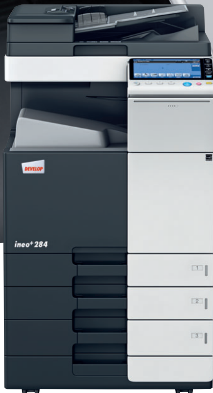
ineo+ 284 with paper feeder (PC-110) and dual scan document feeder (DF-701)