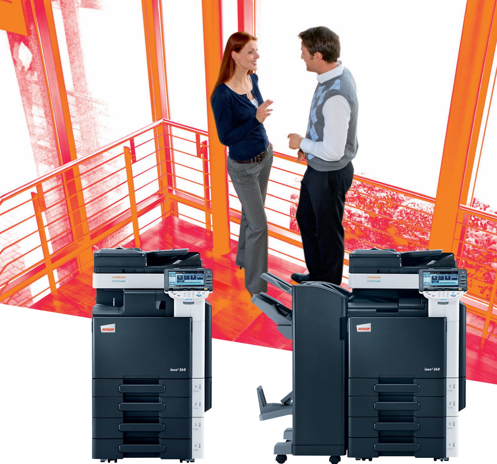
ineo+ 360 with document feeder (DF-617), inner finisher (FS-529) and 2 x 500 sheets universal tray (PC-207)