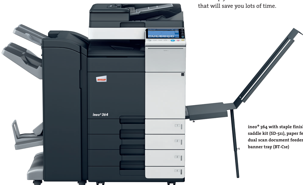
ineo+ 364 with staple finisher (FS-534), saddle kit (SD-511), paper feeder (PC-210), dual scan document feeder (DF-701), banner tray (BT-C1e)

Many multifunctional office systems are anything but user-friendly. The ineo+ 364, in contrast, is simplicity itself. An intuitive, easily understandable operating concept ensures that it is as easy to use as your smartphone or tablet. The 9-inch capacitive touchscreen comes with well-known functions such as flick&drag, and thanks to a new menu navigation structure you can see all functions in one go and select the settings you want with just a few clicks. Frequently used functions can be left on the start screen and ones you don't use simply removed. This is the kind of customisation that will save you lots of time.