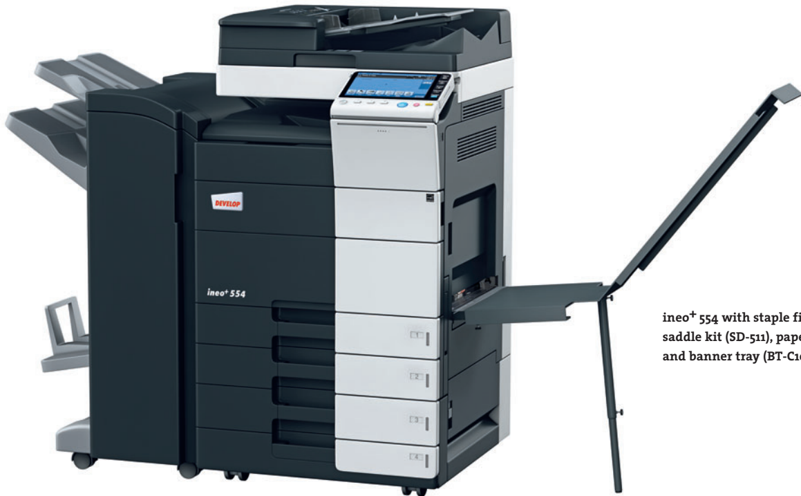
ineo+ 554 with staple finisher (FS-534), saddle kit (SD-511), paper feeder (PC-210) and banner tray (BT-C1e)