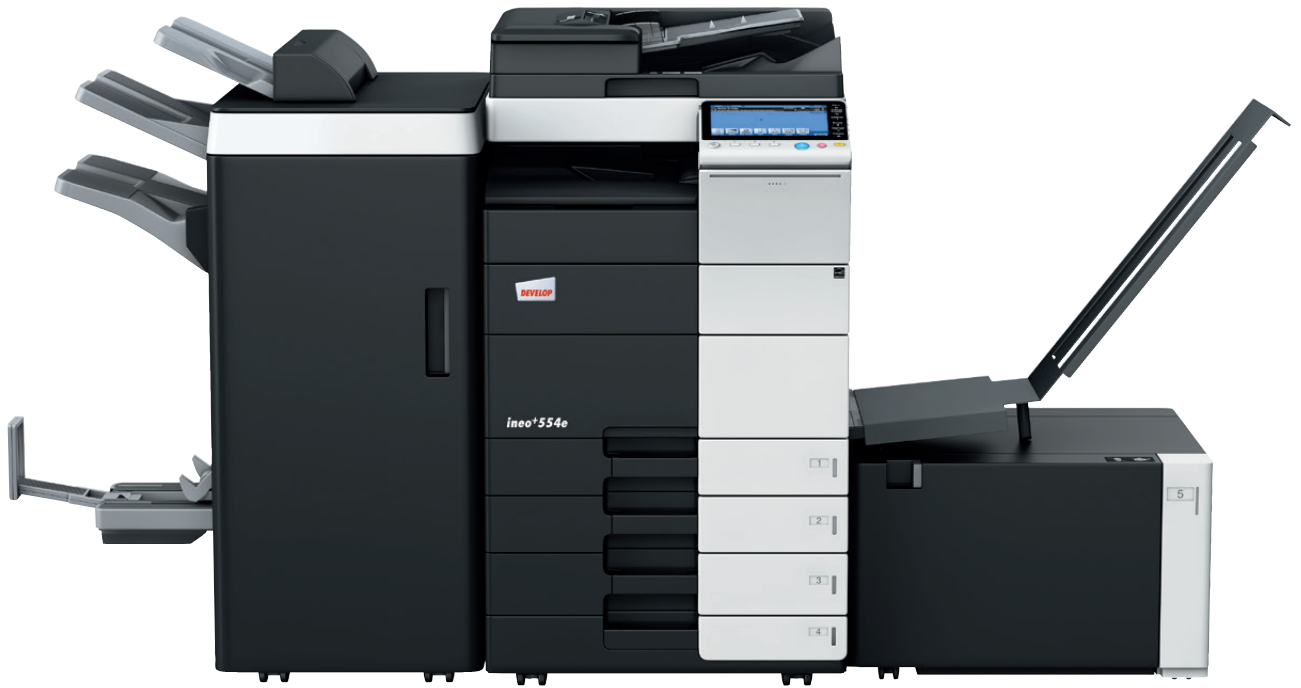
ineo+ 554e with staple finisher (FS-535), saddle kit (SD-512), job separator (JS-602), paper cassette (PC-210), large capacity unit (LU-204) and banner tray (BT-C1e)