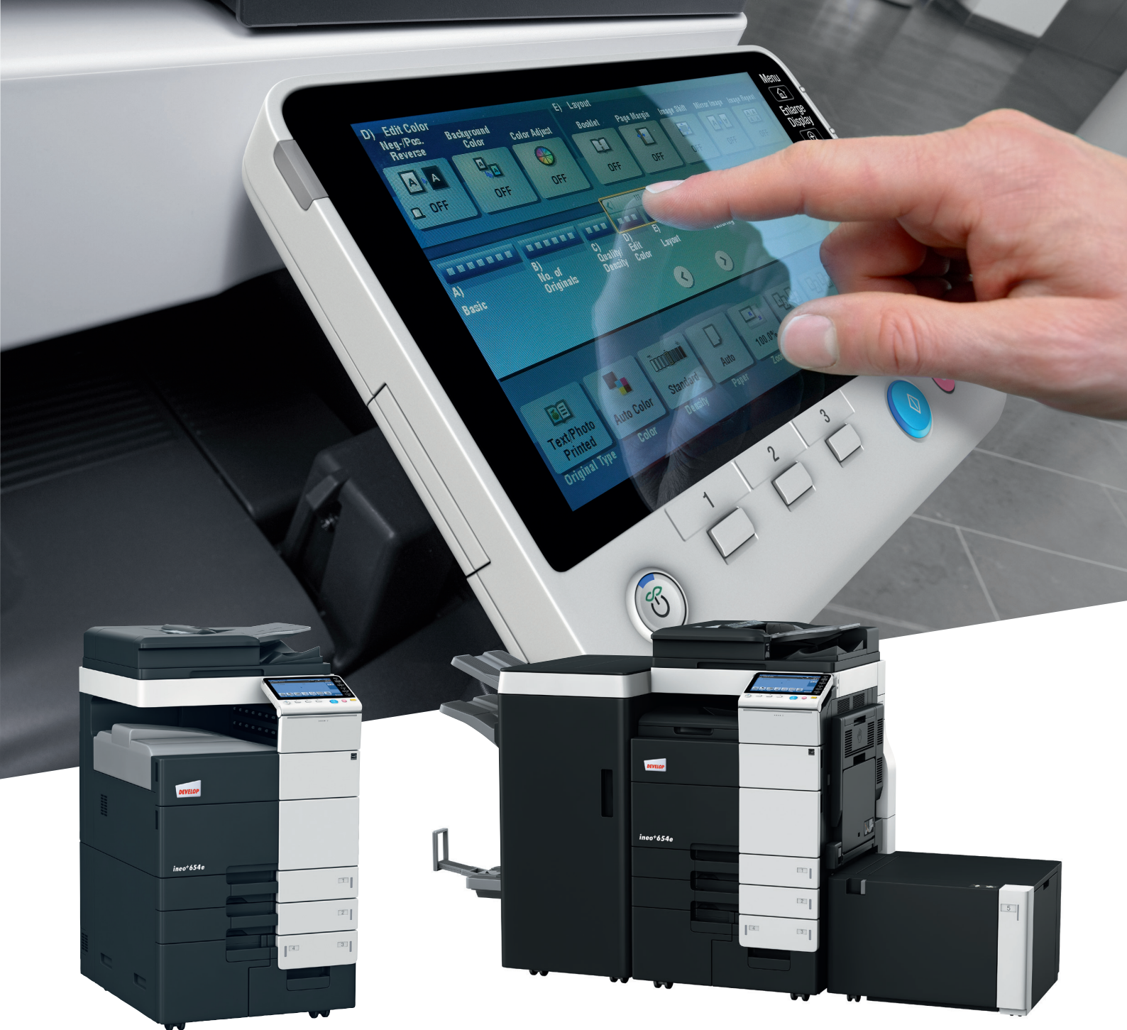
ineo+ 654e with output tray (OT-503)