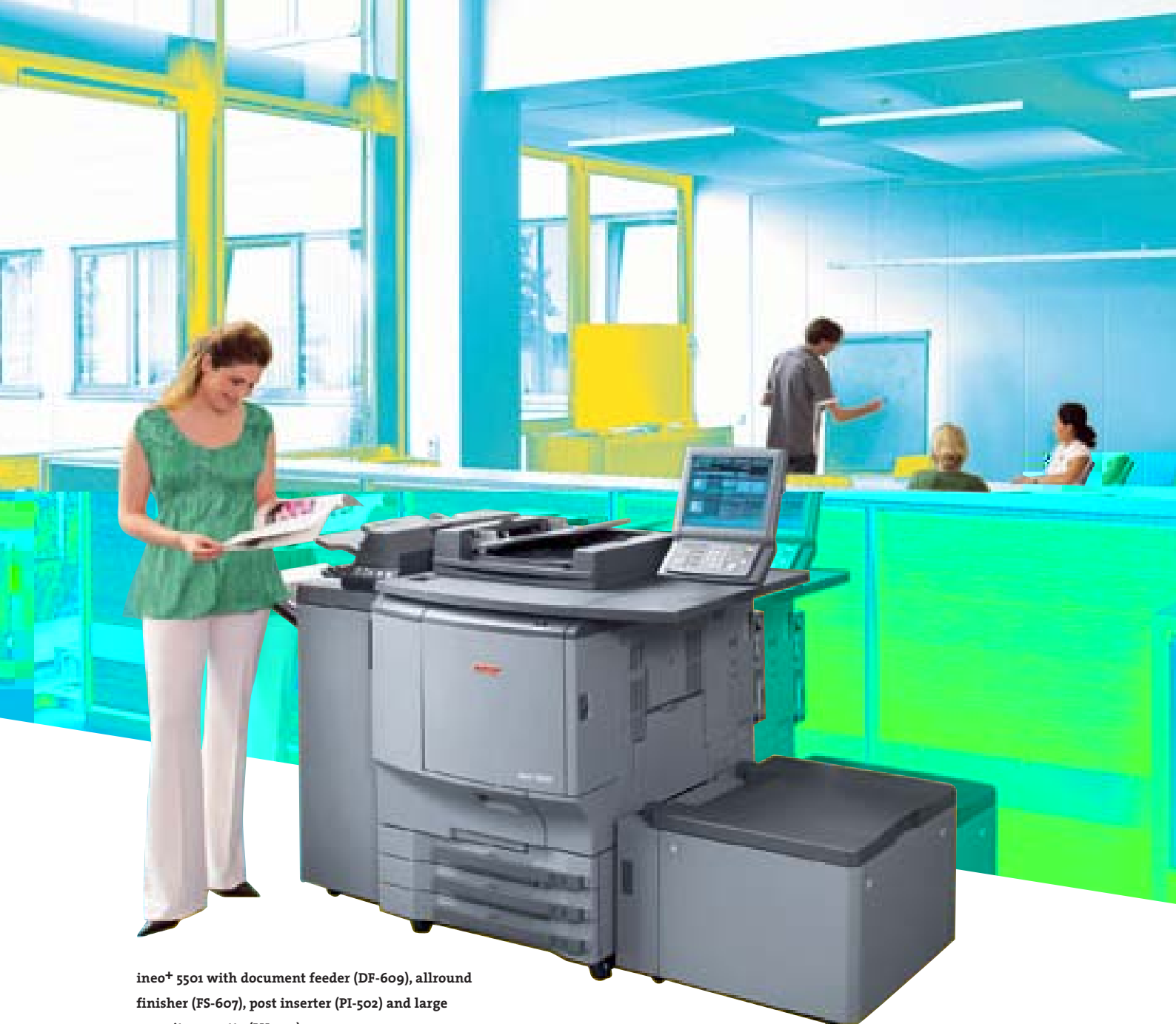
ineo+ 5501 with document feeder (DF-609), allround finisher (FS-607), post inserter (PI-502) and large capacity cassette (LU-202)